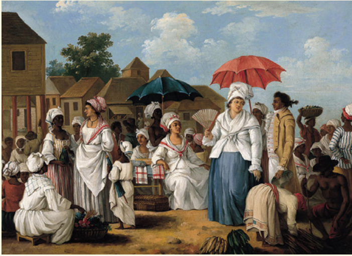
“Linen Market” (ca 1775) A Brunias, oil on canvas

How did Charlotte Amalie residents keep cool in centuries past? With no electricity to power fans or air conditioning, resourcefulness was needed! Here’s how townspeople coped with the tropics’ high heat, especially in summer and on airless autumn days.