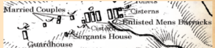
Hassel Island Survey done by Danish Authorities

A surface collection of artifacts was made around the barracks area of the soldiers stationed on Hassel Island during the British occupation from 1801 to 1815. The types of artifacts collected are shown here.