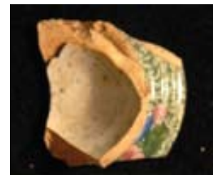
FS34/1, Base of teapot, marked “Spodes New Fayence” on bottom. Author's photograph

The remarkably preserved raised designs on the bowl represent a paddle wheel steamship on one side and an early steam locomotive on the other. The locomotive design is about 1815 or later,