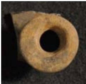
FS30/1 Probable case bottle lip.

The next is a gun flint. It has a groove in the leading edge, indicating that it may have been used as a fire starter. It would not be suitable for use in a musket, as a reasonably smooth striking edge is required to produce good sparking action against the steel of a flintlock. It is of an approximate size (27mm) to have been issued for the “Brown Bess” musket. Although it is not possible to determine the pattern of the musket, it would most likely be the so-called India Pattern musket accepted by the Board of Ordnance in 1795. Apparently more than 3 million of these muskets were produced.