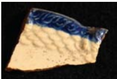
FS36/1 Scalloped shell edge plate fragment with barley border.

Another fragment, a bottle lip, FS30/1 above, is probably from a small “case gin bottle” which was produced from the early 18th century until the middle of the 19th century, although it did not necessarily contain only gin