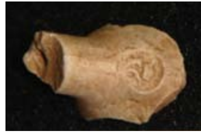
FS38/4 Heel mark of probable Dutch clay pipe. Author's photograph

Clay pipe fragments are common on colonial sites, and can frequently be dated by their stem hole size and maker's marks. The one shown below dates to the early 19th century, and unusually for an English site, has what is probably a Dutch mark. The pipes reflect an indulgence in tobacco smoking as a leisure activity, probably while enjoying some “demon rum”.