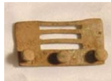
FS8/23 Brass buckle.

Some of these artifacts are illustrated and described here. The first is a brass buckle, probably from a military uniform, possibly for a cartridge belt.