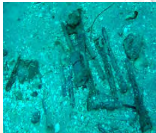
Figure 2 Bronze Spikes and other debris in St Thomas Harbor