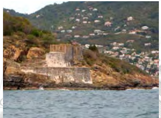
Figure 3 Fort Willoughby, St. Thomas Harbor

In 1801 the British seized St. Thomas, building fortifications and quarters on Hassel Island, only to return it to the Danes after the Treaty of Amiens in 1802. The respite was short-lived; the British again seized the island in 1807 and remained in possession until the end of the Napoleonic wars, greatly inhibiting the trade which had been the life blood of the island.