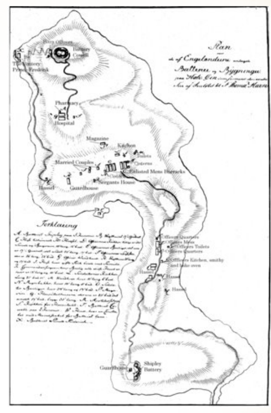
Danish Map of British Fortifications on Hassel Island, 1802

The Trust, and its partner, the VI National Park Service, are working together to preserve, protect make available to the public these wonderful treasures from our past. Please join us in this effort, by becoming a member and sending a contribution for the Hassel Island fund. Only through the contributions member donors will we be able to fulfill these goals.