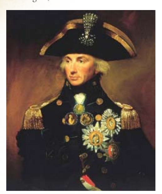
Admiral Lord Nelson

uring the Napoleonic Wars, Britain insisted on the right to stop the merchant ships of neutral countries and seize them if they were carrying war materials (very broadly defined) to France. To counter this, Russia, together with Denmark and Sweden formed the "Armed Neutrality League" to forcefully respond to these seizures. Interpreting this as a serious threat, Britain declared war on Sweden and Denmark at the beginning of 1801. This resulted in Lord Nelson's famous Battle of Copenhagen, where he supposedly turned a blind eye to the Admiral's recall signal, and won the battle.